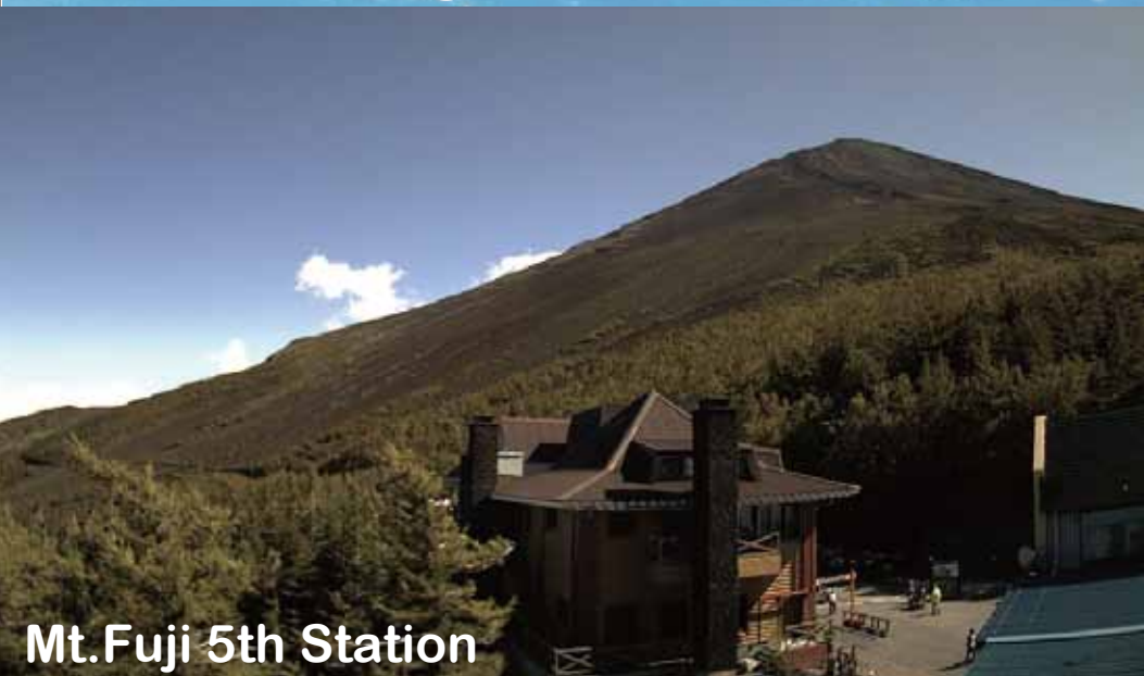
Mt.Fuji 5th Station

(We can accept cash only)(Above fee:over 4 years old)