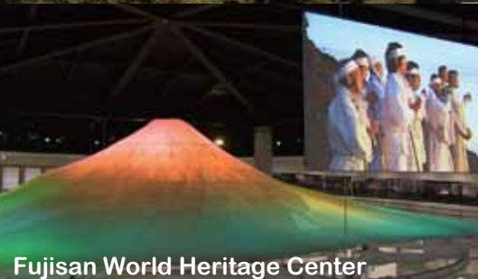
Fujisan World Heritage Center