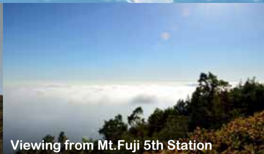
Viewing from Mt.Fuji 5th Station