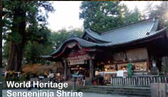
World Heritage Sengenjinja Shrine