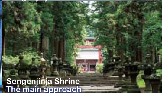
Sengenjinja Shrine The main approach