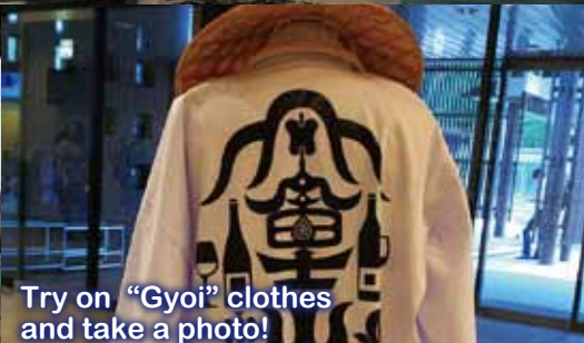
Try on "Gyoi" clothes and take a photo!